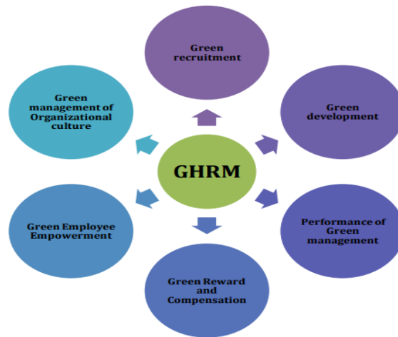
Figure 2: Green Human Resource Management Model

necessary, how the system works, and, finally, how it aids in environmental preservation. Employees get motivation and self-esteem from the events, and they feel good about themselves for being a part of the sustainable program..