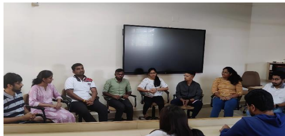
Figure 1. Focus group Interview Panel 1

It is observed that most of the panel members watched the movie because of reviews. The most fascinating element of the movie was portrayal of the cultural aspect, acting and cinematography. Few of them rewatched the movie because of the deep connection felt to the culture portrayed. It was observed that the representatives of Karnataka in the focus group panel, especially the ones from Mangalore were able to connect to the culture more. Hence, it can be comprehended that the cultural connect of the movie was the one which attracted everyone's attention.