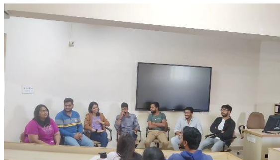
Figure 1. Focus group Interview Panel 2

It is observed that most of members of panel 2 watched the movie because of the cultural portrayal. The IMDB rating and word of mouth also influenced them to watch the movie. Majority of them watched the movie in theatres and the most people felt that the movie was strong representation of culture, beliefs, and rituals deep-rooted in every pocket of India. Most of the panel members could connect with the movie as they have been familiar with similar kind of cultural practices in their region. They believed that the movie should be watched as it spreads the awareness of culture, the rituals and belief system prevalent in India. Also, they opined that the people from religious specific regions can connect to the culture more. It is observed that most of them watched Kantara because of reviews which aroused curiosity about the culture, the way it is portrayed, acting and the cinematography.